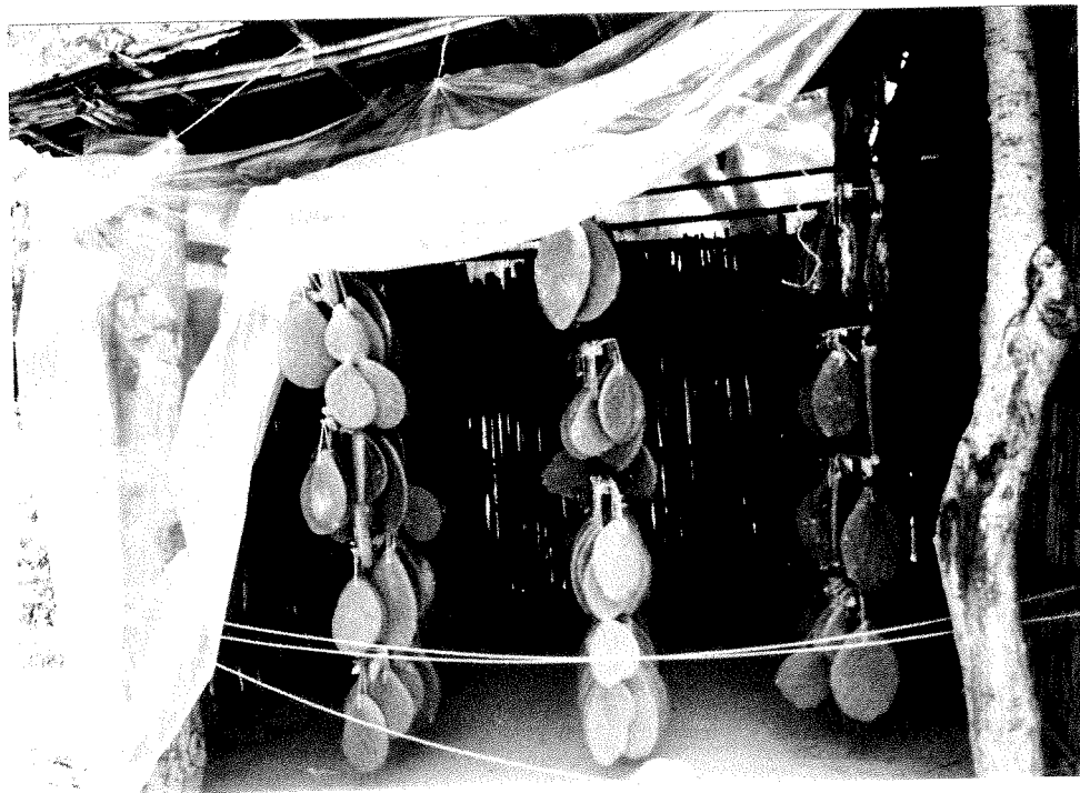
Figure 6. Photographs taken of the cochineal greenhouses in San Pedro Martir (top) and of Ernesto Castaneda Hidaiga pointing out the mother cochineal (bottom).