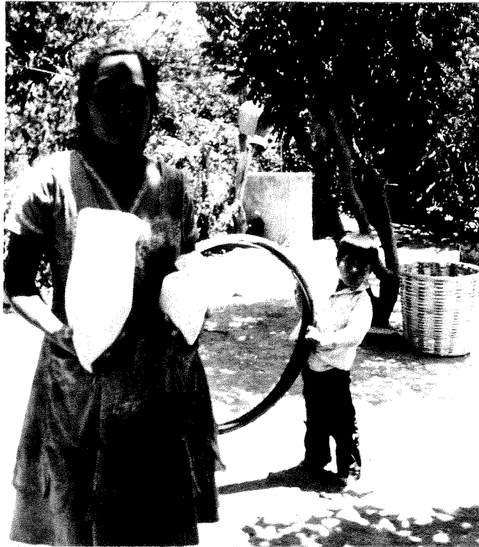
Figure 7. Photograph of an Indian woman holding two sacks of cochineal which she harvested from the greenhouse (top). A photograph of a pan of newly harvested cochineal (bottom).